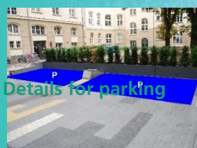
Fig. 5 Courtyard parking 1 and 2