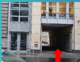
Fig. 4 Courtyard entrance