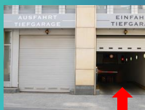
Fig. 3 Underground parking entrance

Follow signs for Schönefelder, and continue on the A113 towards Berlin-Grünau / Dreieck Treptow. Continue on the 96a towards Berlin-Mitte. At the end of the Stralauer Allee, keep straight on to Mühlenstraße, Holzmarktstraße, Stralauer Straße and continue on to Spandauer Straße. After approx. 200 m turn left on to the Anna-Louisa-Karsch Straße.