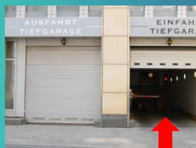
Fig. 3 Underground parking entrance

Follow signs for Schönefelder, and continue on the A113 towards Berlin-Grünau / Dreieck Treptow. Continue on the 96a towards Berlin-Mitte. At the end of the Stralauer Allee, keep straight on to Mühlenstraße, Holzmarktstraße, Stralauer Straße and continue on to Spandauer Straße. After approx. 200 m turn left on to the Anna-Louisa-Karsch Straße.